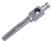
KEC10B Banana Connector Pin