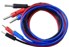
KEC10A Banana Cable Set