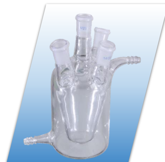
Gas-tight cell with water jacket Product ID: KEC04