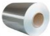
KA19 Al Foil Thickness: 16µm Width: 200mm Purity: >99.45%