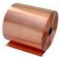
KA17 Cu Foil Thickness: 0.1mm Width: 300mm Purity: >99.50%