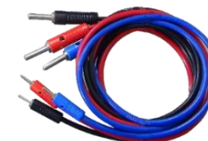
KEC10A Banana Cable Set