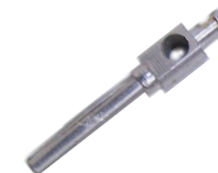
KEC10B Banana Connector Pin