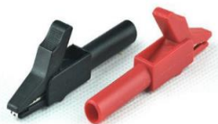
KA01 (Red), KA02 (Black) Alligator Clip