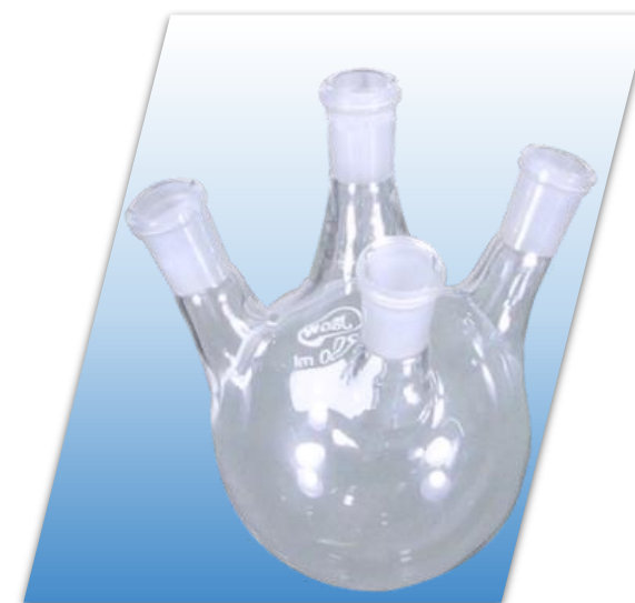
Round Bottom cell Product ID: KEC06