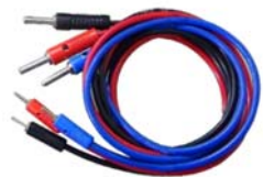
KEC10A Banana Cable Set