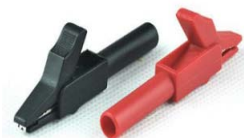
KA01 (Red), KA02 (Black) Alligator Clip