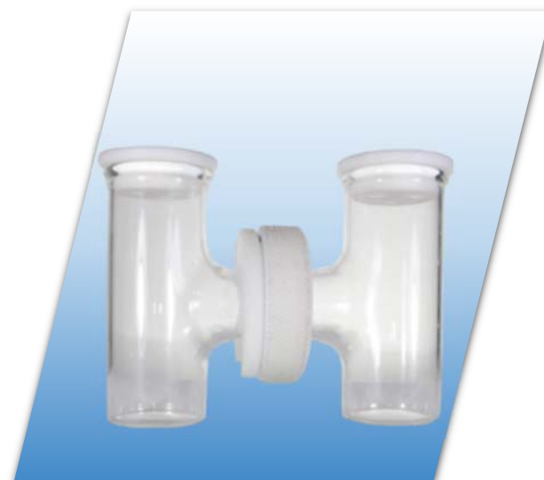
H-cell with membrane holder Product ID: KEC14