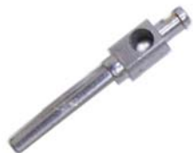
KEC10B Banana Connector Pin